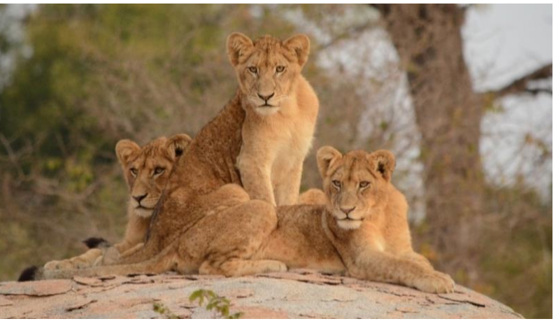
An unforgettable Big 5 wildlife experience, just 2 hours outside of Johannesburg. Pilanesberg provides the perfect setting to indulge in an African Safari for those with limited time.